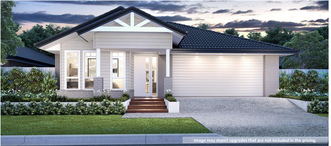
Image may depict upgrades that are not included in the pricing.

Floor area: 250.74m 2 / 26.99sq | Block Size: 897m 2 Address: Lot 808 Yeomans Road, Foothills Estate, Armidale 2350